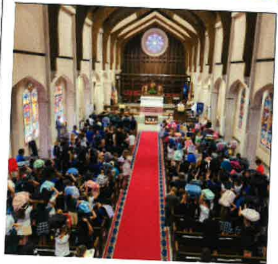
Blessing of the Backpacks August 20, 2024