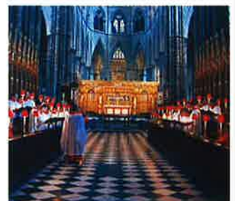
Evening prayer often takes the form of Choral Evensong, such as this service at Westminster Abbey