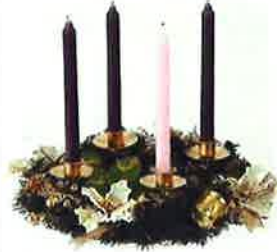
Advent Wreath with candles depicting the colors of the four Sundays of Advent