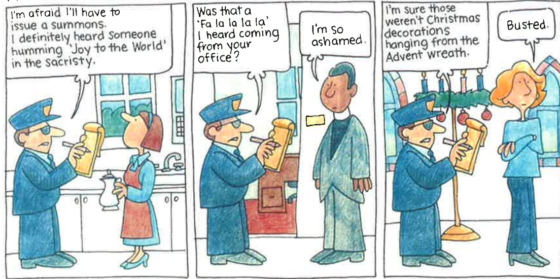
THE ADVENT POLICE

Trinity Episcopal Church ♦ Longview, Texas ♦ December 2014 ♦ Volume 24, Issue 12